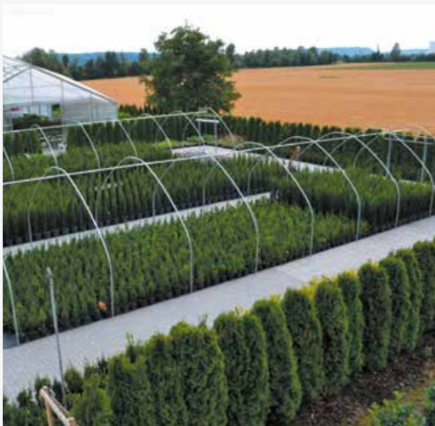
TTE® system and the culture mat: the eco concept for production and sales surfaces

Soil structure improvement by admixture of sand and aggregates (contact us at 01711968639)