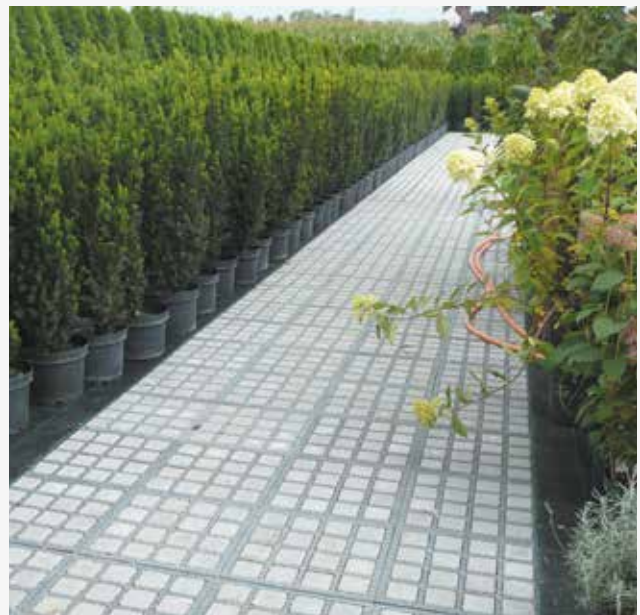
The flexible, modern and cost-saving solution