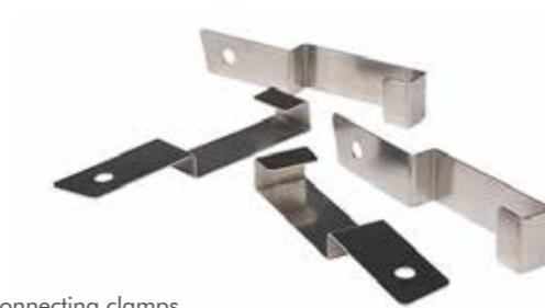
TTE® connecting clamps

The TTE® connecting clamps fix the edge areas of the TTE® surface so that slipping apart is prevented. Approx. 4-5 clips are required per corner.