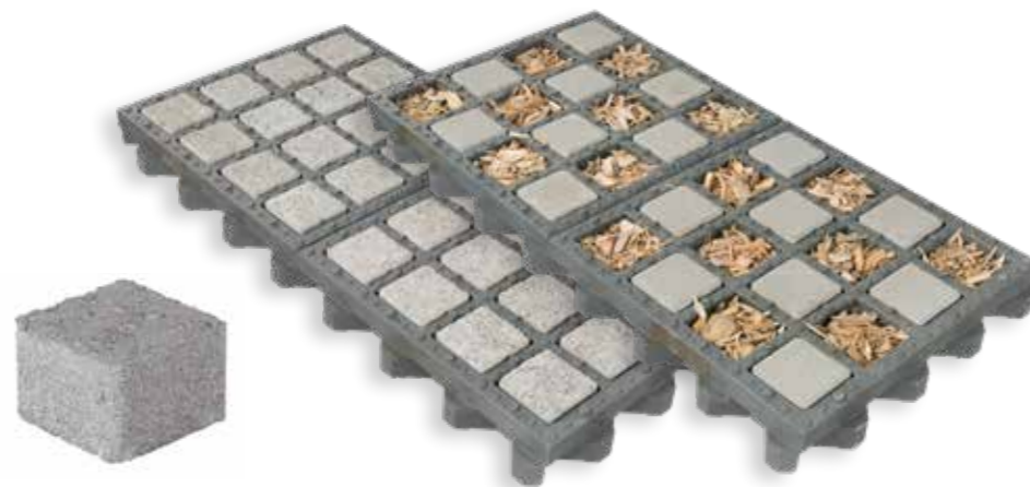
TTE® Paver GRIP

To fill 1 m 2 of TTE® you need 100 TTE® Paver GRIP stones.