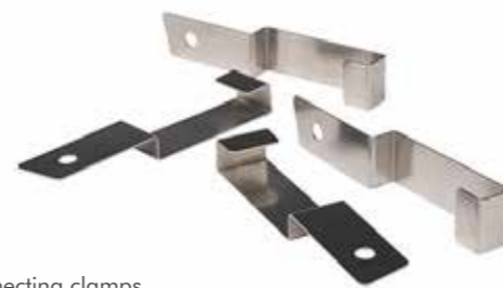
TTE® connecting clamps

The TTE® connecting clamps fix the edge areas of the TTE® surface so that slipping apart is prevented. Approx. 4-5 clips are required per corner.