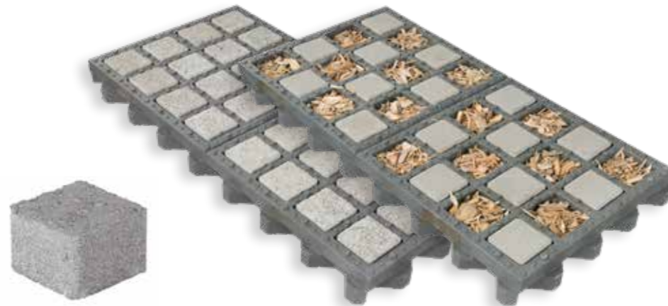
TTE® Paver GRIP

To fill 1 m 2 of TTE® you need 100 TTE® Paver GRIP stones.