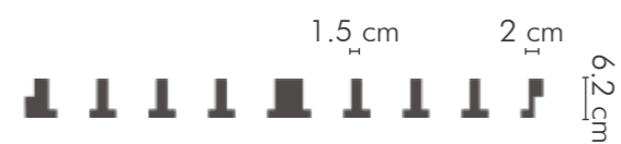
Cross-section TTE® MultidrainPLUS